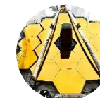
ISS, Science, Exploration, In Orbit Economy