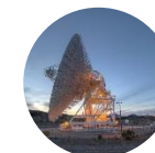
Space Situational Awareness