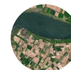
Copernicus, EO Programmes