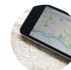
Galileo and EGNOS