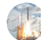
Ariane, Vega, Microlaunchers