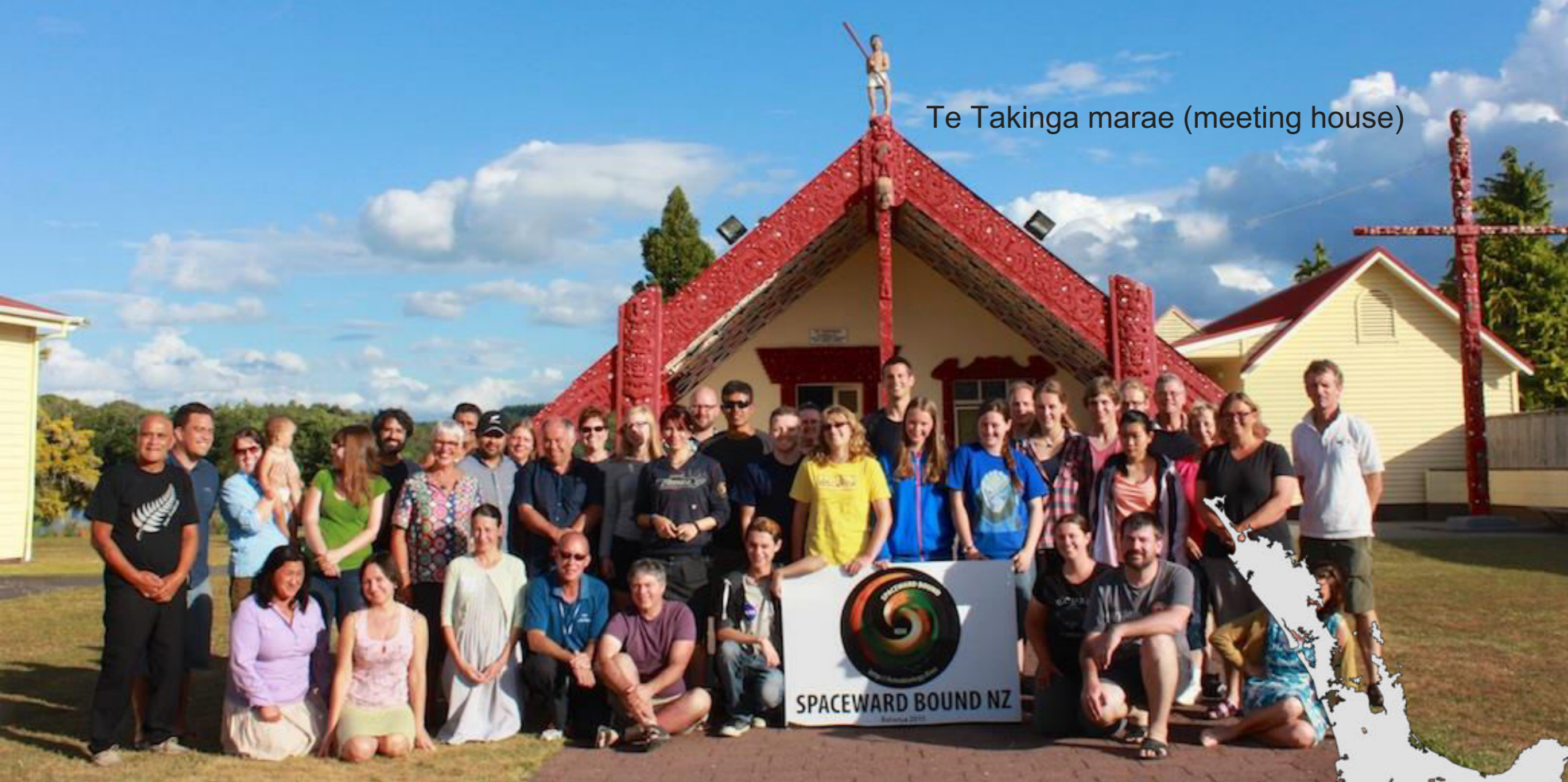
Te Takinga marae (meeting house)