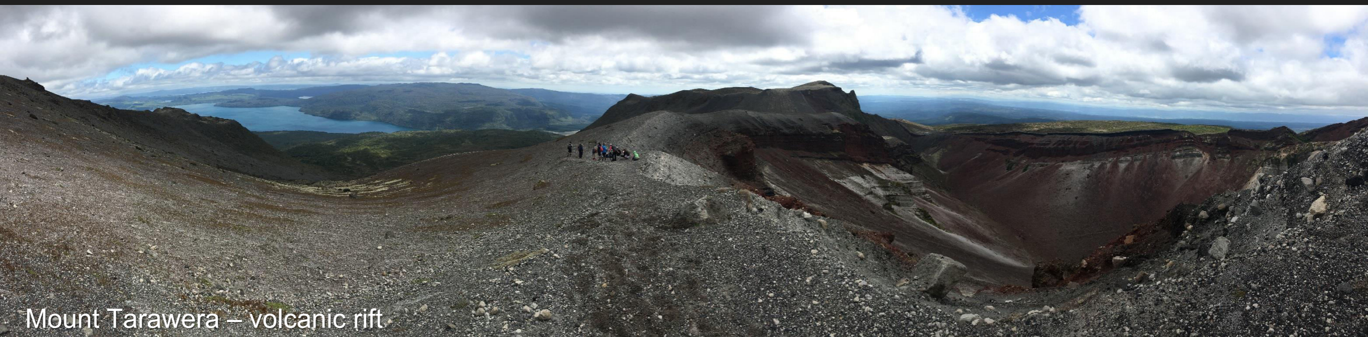
Mount Tarawera – volcanic rift

SPACEWARD BOUND NEW ZEALAND FOR YOUTH 2016: AN EDUCATIONAL, FIELD-BASED PROGRAM WITH SPACE FOR WOMEN & GIRLS A PILOT EXPEDITION USING A MĀTAURANGA MĀORI APPROACH TO TEACHING ASTROBIOLOGY IN NEW ZEALAND