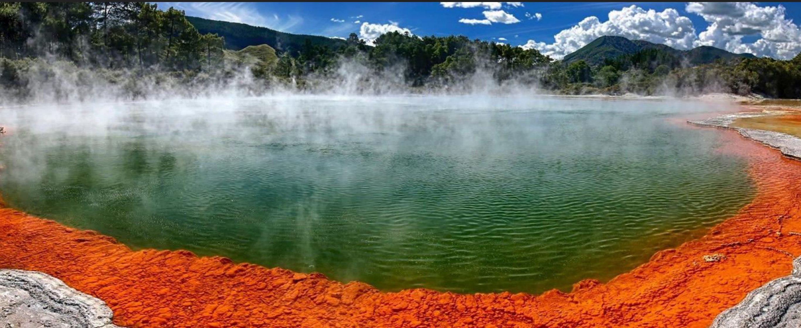
Champagne Pool, Wai-O-Tapu geothermal area