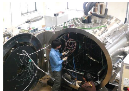
Thermal vacuum chamber at CeNT