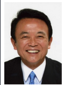
Mr. Taro Aso Prime Minister Director-General