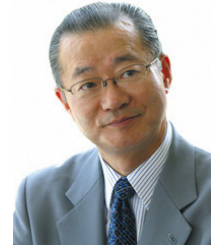
Mr. Takeo Kawamura Chief Cabinet Secretary Deputy Director-General