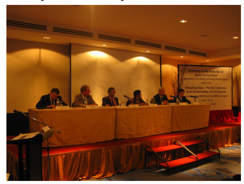
Space Policy Division, Foreign Policy Bureau Ministry of Foreign Affairs of Japan

held in Kuala Lumpur, Malaysia on 12th December, 2012