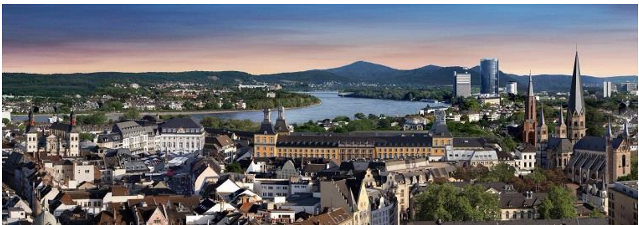
Bonn, Rhineland Germany