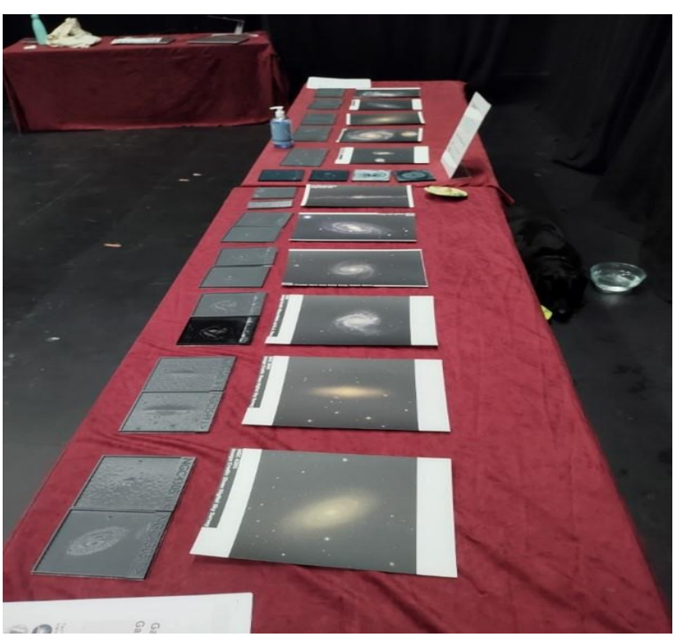
The Tactile Universe models set up at a public outreach evening held during the National Astronomical Meeting 2022

For slightly higher technology alternatives for the future, the use of haptics represents an exciting leap forward, though it's expensive. In the future, being able to feel the 3D shapes of objects in virtual spaces or interpret data sets through haptics has a lot of potential.