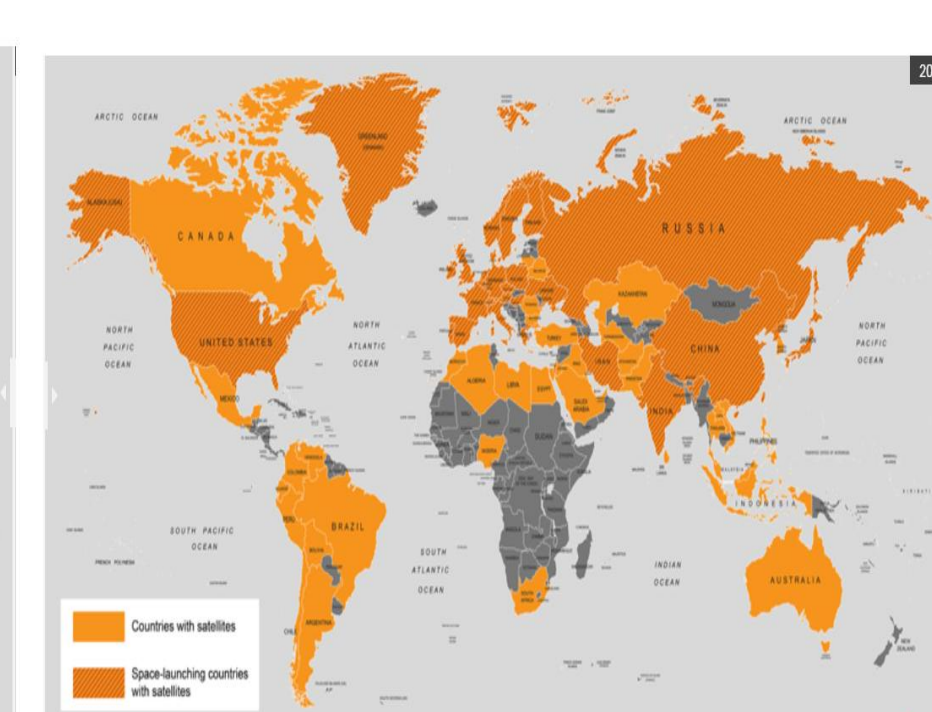
Comparison of countries with satellites in 1966 V/S 2016 (UCSUSA.org)