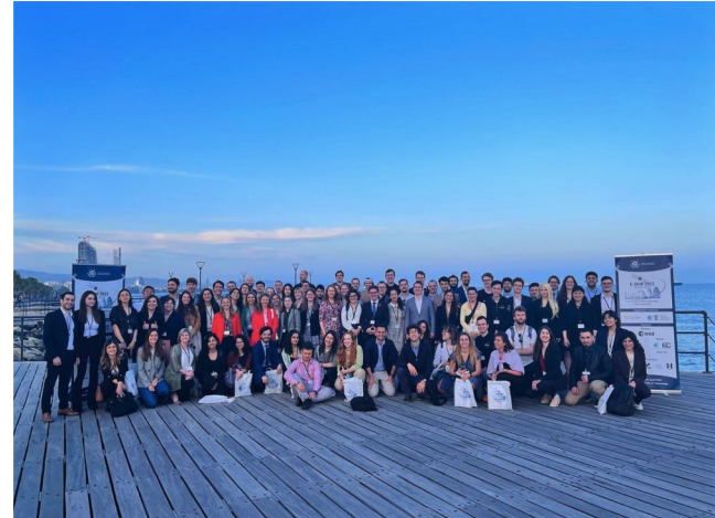
SGAC's European Space Generation Workshop, Cyprus (April 2022)