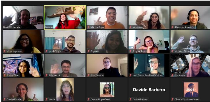
One of the SEPG's meetings featuring our international members (ACHIEVED)