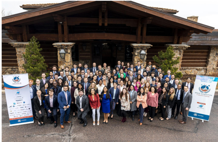
SGAC's Space Generation Fusion Forum, USA (April 2022)