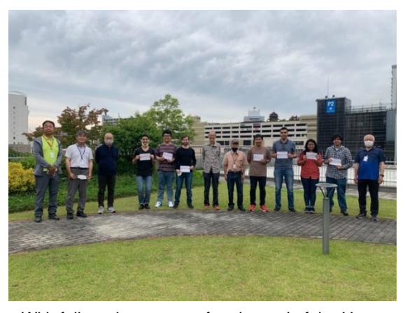
With fellow classmates after the end of the Ham Radio Test, which is needed to operate the Ground Station at Kvutech

I truly feel that Kyutech brings the world into your hands.