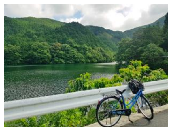
Breathtaking scenery in Japan. Biking has become an important part of my life in Japan.

My advice for the application would be to have a clear idea of what you want to do at Kyutech, especially what the experience that Kyutech has to offer for you, but also what you can offer to Kyutech. It is also significant to have a vision of what you want to do after you finish your studies there. Kyutech wants to support and enable more non-space faring countries to develop in space, and the reason you want to study space engineering should go into that direction. Another tip to anyone who is interested in PNST is to not be afraid of new challenges and just go for it! Stepping out of your comfort zone is always frightening, and things might be challenging, requiring a lot of work. However, remind yourself that you are always learning something new and that this experience is helping you get closer to your goals. Make sure to have a determinate goal, in your mind and in your heart as well, as this will motivate you when you get lost and remind you of why you are there.