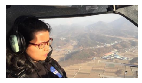
Flight Dynamics practice on a CTWS flight design training airplane

How did you learn about the PNST fellowship and where were you at the time in your studies and career?