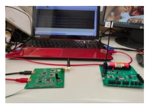
(Top) 400/433MHz LoRa receiver. Simplified version of the LoRa receiver on board the KITSUNE satellite (Bottom) Checking communication between the LoRa receiver and Ground Sensor Terminal (GST)

y research topic is the utilization of Long Range (LoRa), a new technique for satellite and ground communication. LoRa has various advantages such as enabling long range communication with low energy consumption and low costs compared to other similar technologies, which makes it very attractive for its applications to the Internet of Things (IoT).