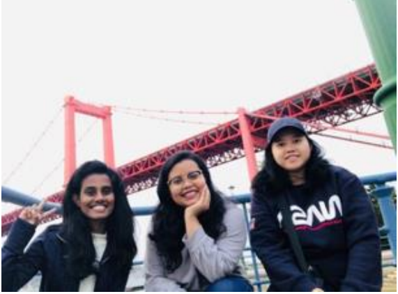
Fellow space engineering students from Sri Lanka and Myanmar.