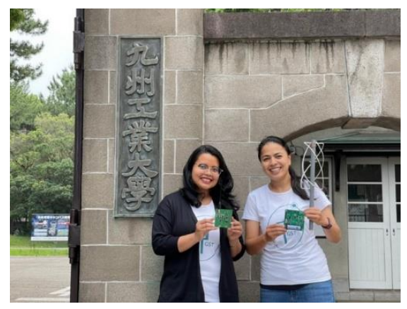
With mentor and fellow PNST student from Bhutan

There are many successful female students, tutors, and staff that you can look up to and ask for support from. I truly feel that Kyutech brings the world into your hands.