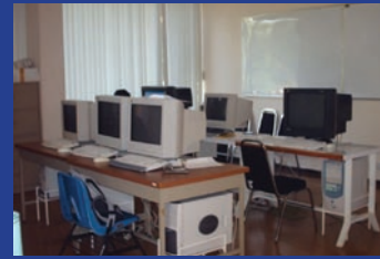
Postgraduate courses Laboratory, Mexico