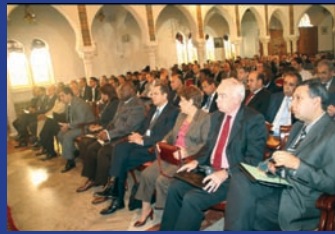
International workshop on Climate Changes Algiers, Algeria, October 2007