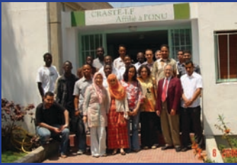
Participants of the postgraduate courses