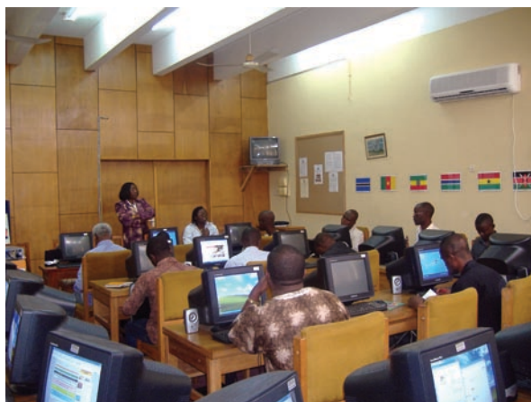
A training session