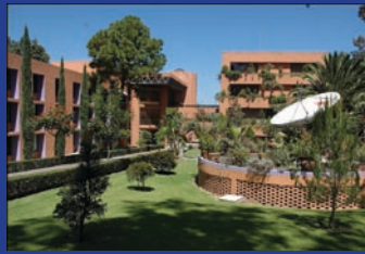
CRECTEALC, Campus Mexico