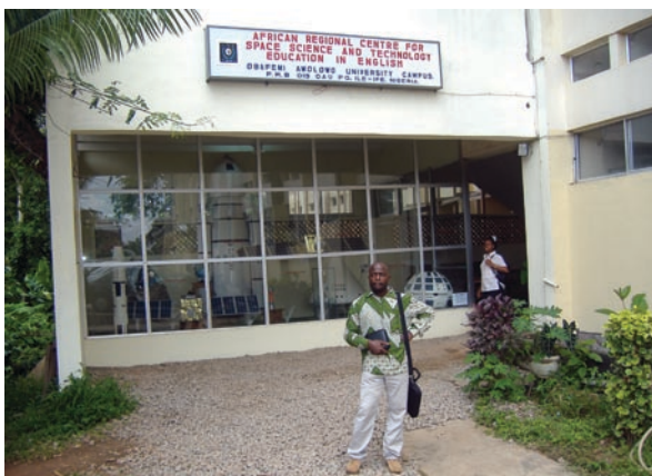
Main entrance to the Centre