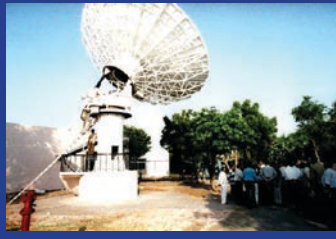
Dedicated earth station for satellite communication students