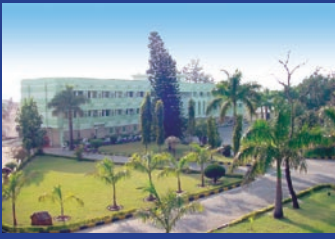
Indian Institute for Remote Sensing Dehraum