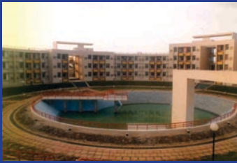
International hostel facilities at SAC, Ahmedabad