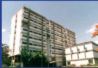
Physical Research Laboratory, Ahmedabad