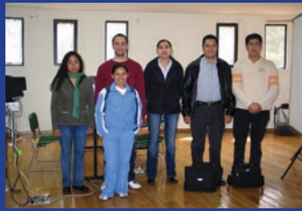
Students of the first postgraduate course of RS & GIS, 2006