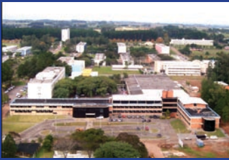
CRECTEALC, Campus Brazil