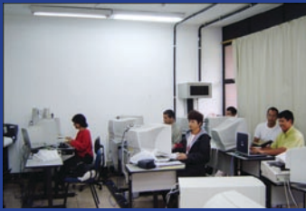
Geo Process Laboratory