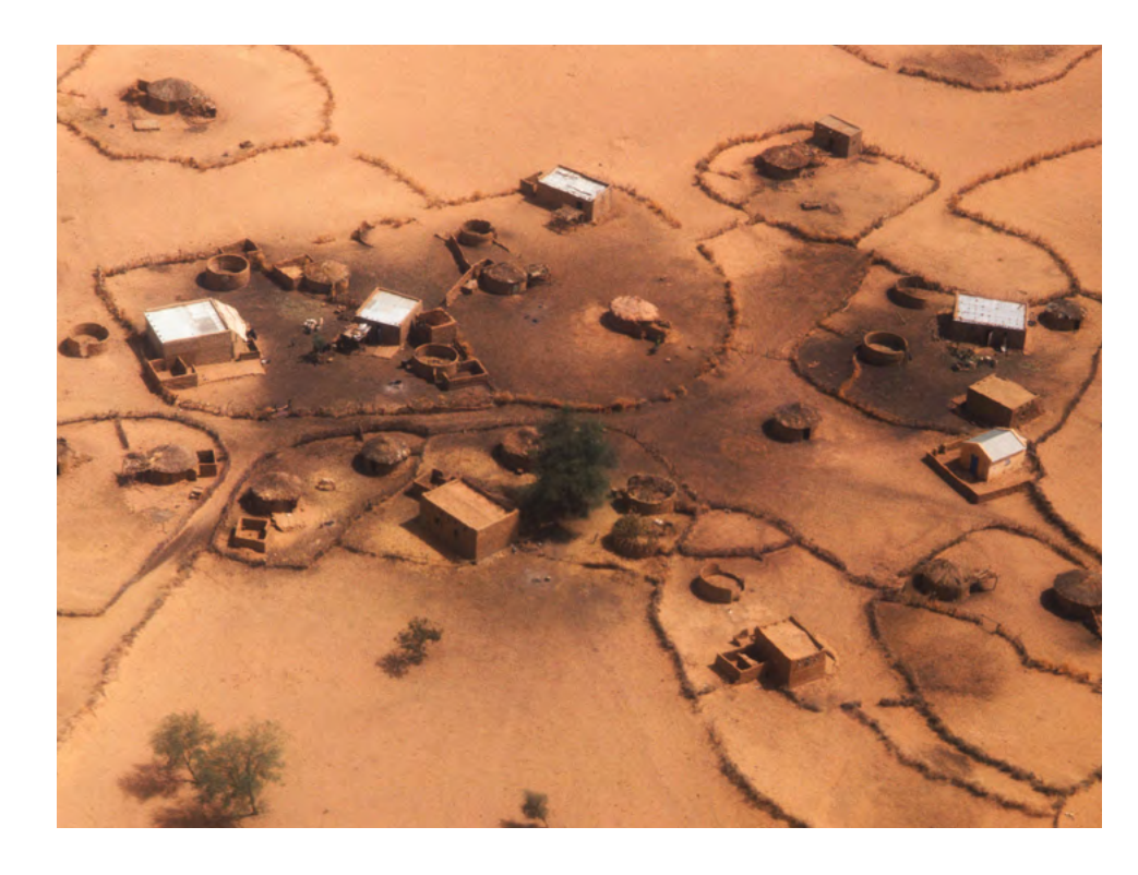
Mauritian village affected by drought.

The agricultural stress index system is based on the vegetation health index (VHI), which was derived from the normalized difference vegetation index (NDVI) and developed by the Center for Satellite Applications and Research of the National Environmental Satellite, Data and Information Service of the United States. VHI has been successfully applied under many different environmental conditions around the globe, including in Asia, Africa, Europe, and North and South America. It can detect drought conditions at any time of the year. For agriculture, however, only the period that is most sensitive for crop growth (temporal integration) is of interest, so the analysis is performed only between the start and end of the crop season.