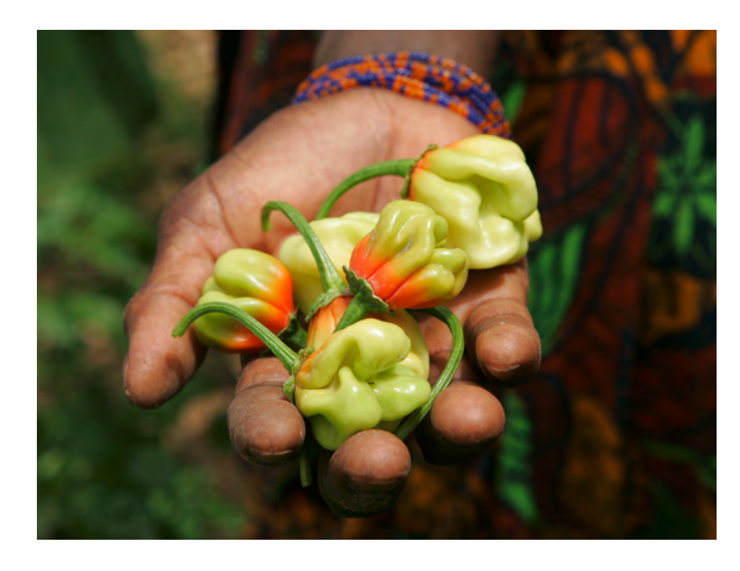
Senegalese woman holding home-grown peppers.

Space technologies, especially in terms of systems for Earth observation and characterization of agroecological zones and ecosystems, could prove an important asset in informing decision makers through assessing the state of conservation of biodiversity for food and agriculture, estimating the health status of ecosystems and predicting threats from climate change and invasive alien species, among other things. Depending on its resolution, space-derived imagery can provide information used in direct approaches (species composition, land cover) and indirect approaches (primary productivity: chlorophyll, ocean colour; climate: rainfall, soil moisture; habitat: digital elevation, biomass structure) for quantifying and modelling biodiversity. Space technologies can also provide additional value by integrating images and mapping abilities into existing information systems on genetic resources for food and agriculture.