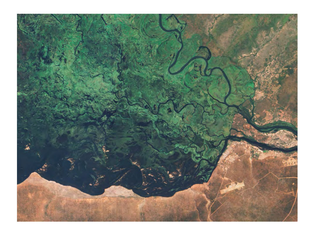
Floods of the Zambezi and Chobe Rivers in Namibia.

There is a serious need to bridge the gap between the scientific flood forecasting and modelling community and the humanitarian and local support systems in risk-prone areas. In this context, end users are not limited to humanitarian agencies, but rather also include ground-level end users such as smallholder farmers. Critical forecasts will not only allow timely humanitarian planning (pre-positioning), but also enable the most vulnerable members of communities to prepare for and ultimately build resilience to repeated shocks.