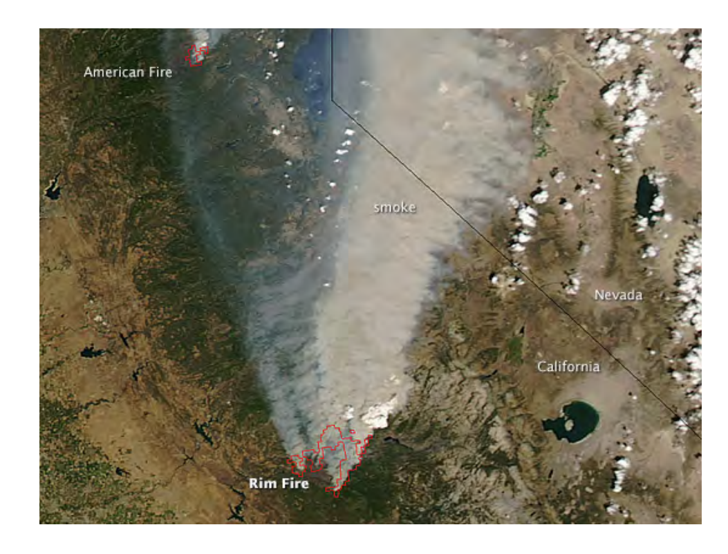
Rim fire in California.

GFIMS is hosted by the Natural Resources Department of FAO and is based on the Fire Information for Resource Management System (FIRMS) developed at the University of Maryland. The system provides information to strategic land managers for policy formulation, including on detection and early warning, deployment of assets for fire suppression, follow-up restoration planning, strategy development for preparedness and prevention, ecological monitoring, modelling of fire emissions, and validation of fire risk maps—all from global to local scale. It is intended to be one of the components of an operational monitoring system of FAO that delivers near-real-time information to ongoing monitoring and emergency projects.