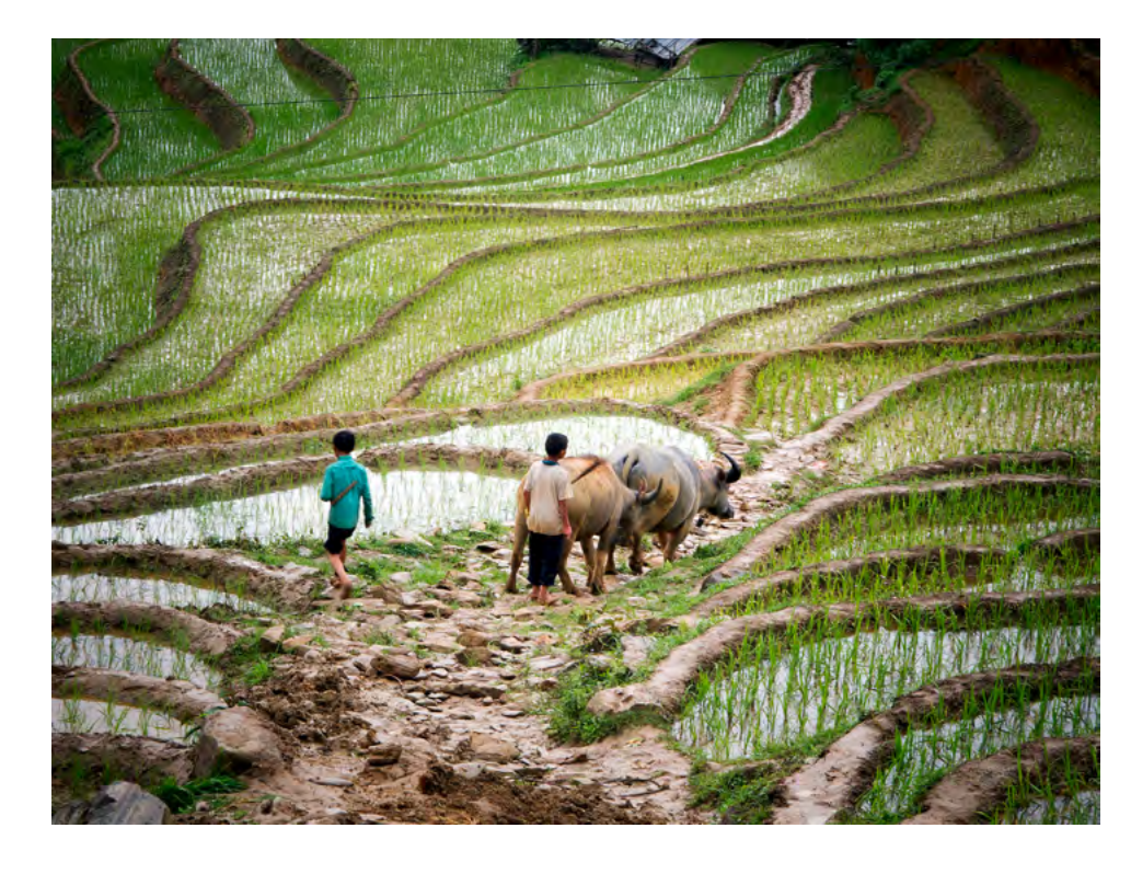
Rice fields in Viet Nam.

The use of the space environment to uncover hidden potential in crops, commonly described as space breeding, was a focus of a project undertaken by the Joint FAO/IAEA Division of Nuclear Techniques in Food and Agriculture. Approximately 10 kg of rice of the Pokkali variety was sent into space by a Chinese spacecraft to observe heritable alterations in the genetic blueprint of these seeds and planting materials induced by the effects of cosmic rays, microgravity and magnetic fields in space. Upon return to Earth, the seeds were planted in the greenhouse at the FAO/IAEA Agriculture and Biotechnology Laboratory in Seibersdorf, Austria, with the objective of evaluating progeny for desirable traits such as resistance to stress and improved quality.