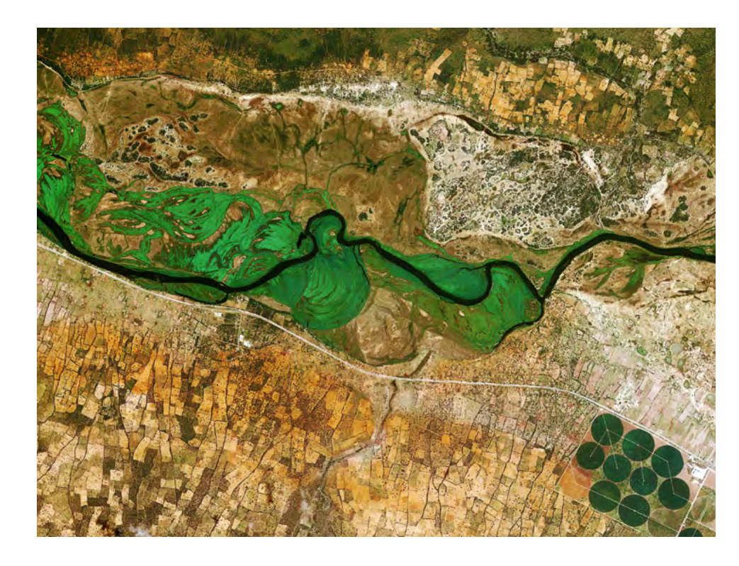
Rural areas along Okavango River in northern Namibia and southern Angola.

Available high-resolution satellite remote sensing data combined with satellite navigation data are also used in precision irrigation and precision farming techniques. Those techniques help in gathering data on factors such as soil condition, humidity, temperature, intensity of planting and other variables in order to precisely identify water, fertilizer and pesticides requirements. Accurate targeting of such areas contributes to an optimal distribution of water and fertilizers, which not only improves crop yields but also reduces costs and the environmental impact of agricultural activities.