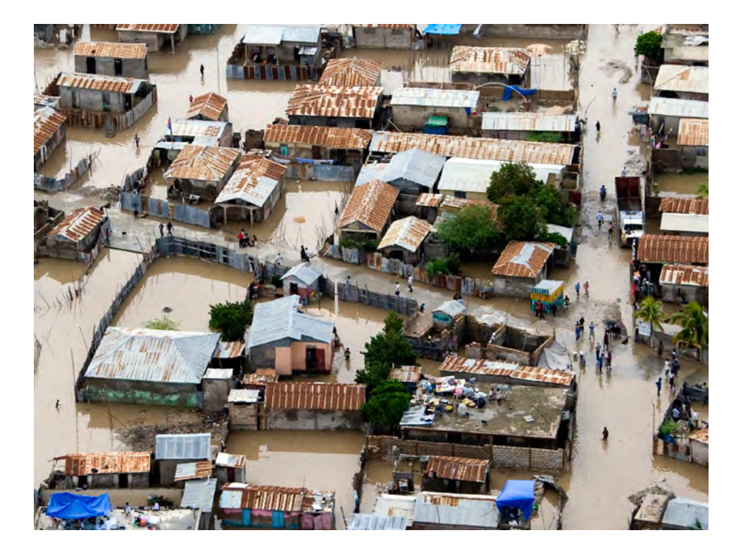
Flooded streets in Gonaives, Haiti, after a hurricane.

Furthermore, as communications capabilities are often limited by emergency-related destruction, satellite communications facilitate smooth and expedient coordination that is critical for prompt understanding of the extent of damage and complex planning with respect to food, water and other necessities, without the need for costly ground-based infrastructure. Satellite navigation and positioning technology is indispensable for tracking and tracing food security efforts during such devastating events, as well as for fleet management related to food delivery. United Nations entities assist Member States by addressing institutional challenges, strengthening policy formulation and building technical capacities to use space technology for disaster management and emergency response.