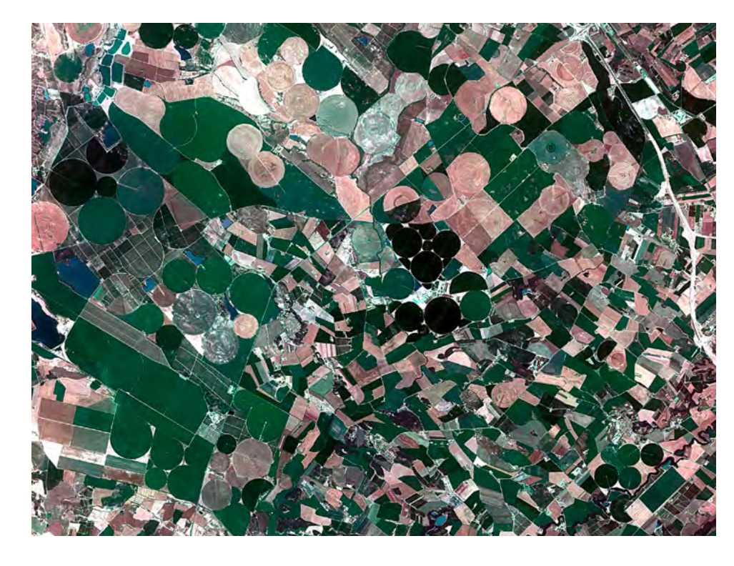
Agricultural crops in Aragon and Catalonia, Spain.

Promoting a participatory process with land users and service providers at the subnational level improves their inputs and access to information, technical knowledge and know-how, and thereby facilitates the empowerment of farmers, livestock keepers and foresters in implementing sustainable production systems. The combined use of geospatial information and participatory assessments provides an effective decision-making process for enhanced spatial planning (land use/territorial) and sustainable land resource management among the various sectors and actors.