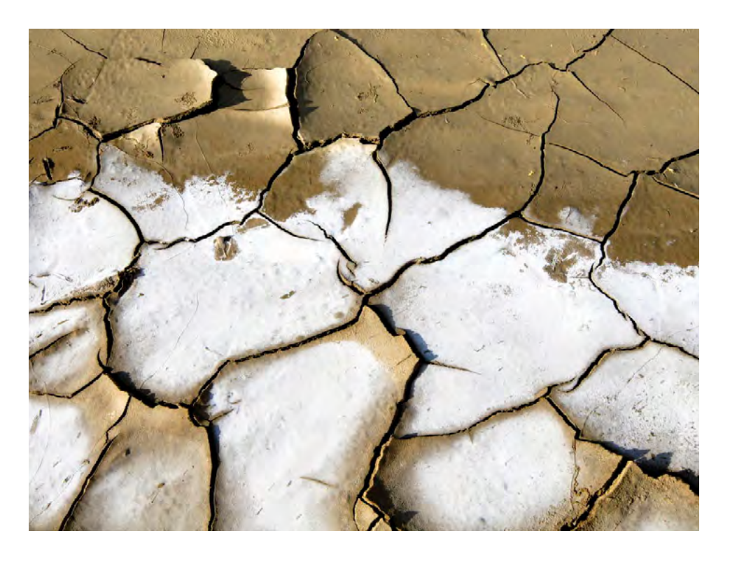
Dryland in Timor-Leste.

Space technology offers unbeatable advantages in view of homogeneity and spatial and temporal coverage of observations, and allows the monitoring of various elements of desertification processes. These elements include climate-related variables, surface albedo (fraction of reflected radiation), surface temperature, moisture, vegetation indices, as well as changes in vegetation cover, land surface composition, sand transport and wind transportation. Since desertification is a complex, cross-sector environmental problem promoted by multiple drivers, its monitoring requires the integration of human- and environment-based variables. Being essential for early warning and monitoring of desertification development and its extent, remotely sensed information also assists in evaluating the impacts of policies to combat desertification.