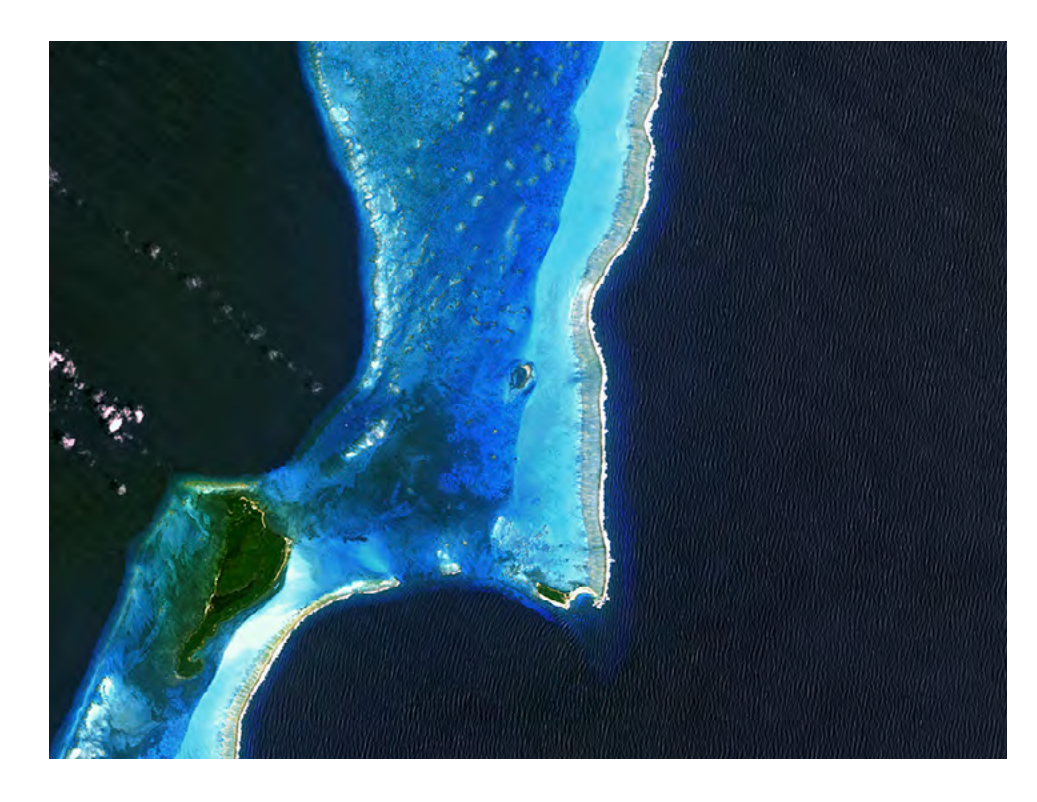
Lighthouse Atoll in the Belize Barrier Reef.

Space technology is of great value when it comes to characterizing marine and coastal environments. Satellite navigation technology allows authorities to track the position, course and speed of fishing vessels, which is necessary in fighting illegal, unregulated and unreported fishing practices, and contributes to the efficiency of fishing management. Secure satellite communications assist in the transfer of information between ships and shore. Improved weather forecasting through the use of meteorological satellites contributes to safety for fishermen at sea.