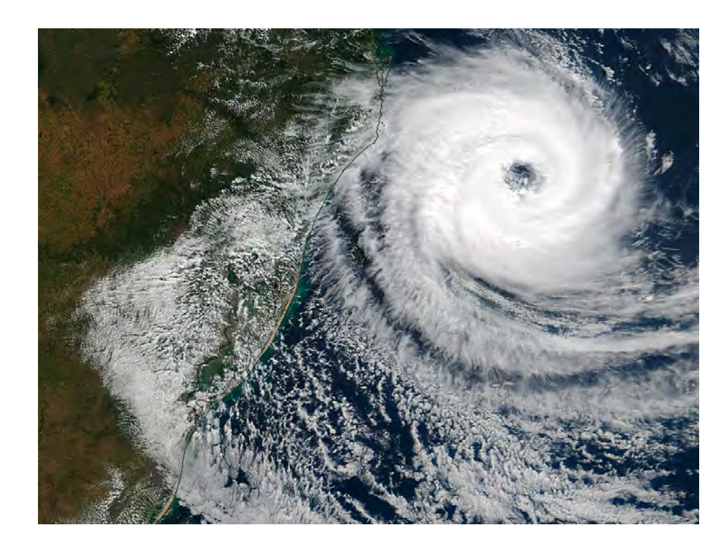
Tropical cyclone off the coast of Brazil.

Observations derived from satellites are extensively assimilated in numerical weather prediction models to support short- to medium-range weather forecasts. Rainfall estimations derived from infrared and/or microwave satellite imagery help farmers plan the timing and amount of irrigation for their crops. Land-surface temperature and soil moisture products are starting to be operationally available. At the same time, ground-based measurements of air and soil temperature and soil moisture continue to be used for verification.