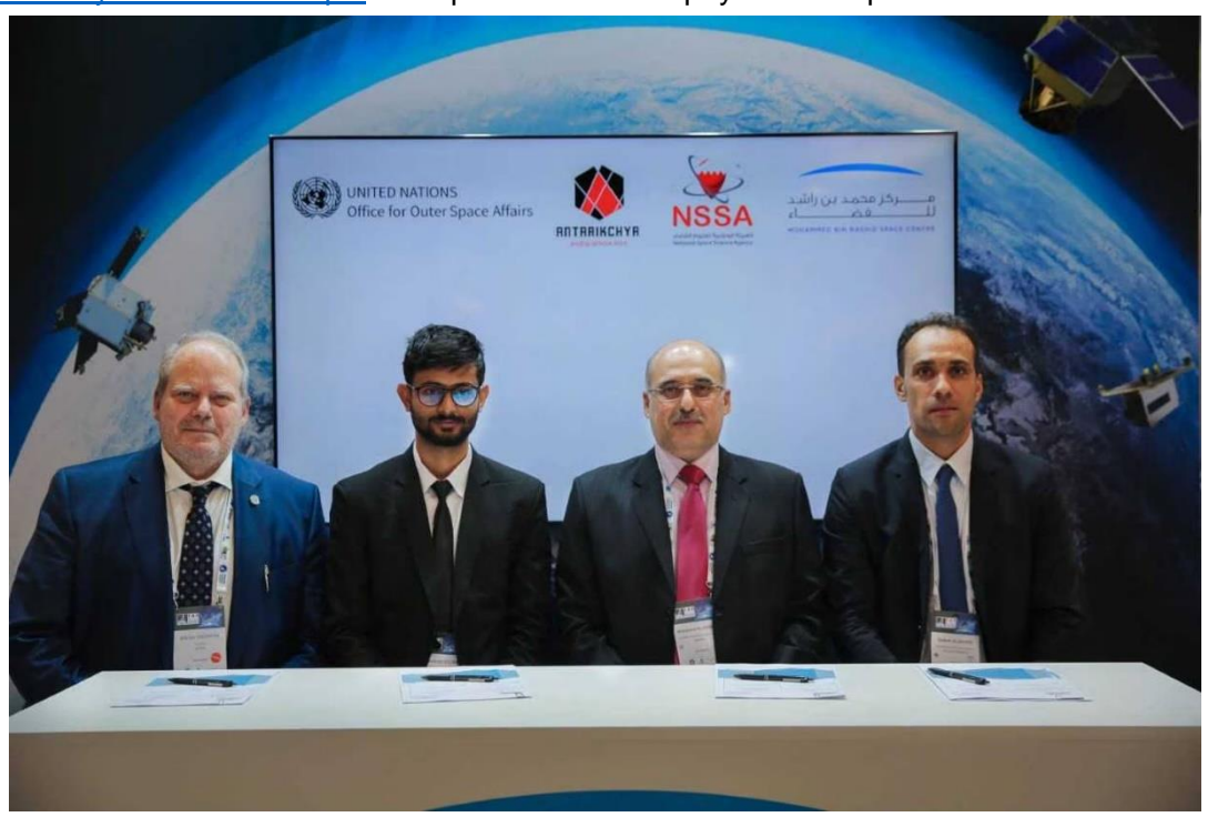
Announcement of Awardee Event at the IAC 2022 in Paris

The 1<sup>st</sup> round of applications opened in January 2022. After a competitive selection process, UNOOSA and MBRSC announced the 2 awardees of the 1<sup>st</sup> round at the 73<sup>rd</sup> International Astronautical Congress (IAC) in Paris in September 2022. Teams from the <u>National Space Science Agency of the Kingdom of Bahrain (NSSA)</u> and the <u>Antarikchya Pratisthan Nepal</u> were picked to deliver payloads to space.