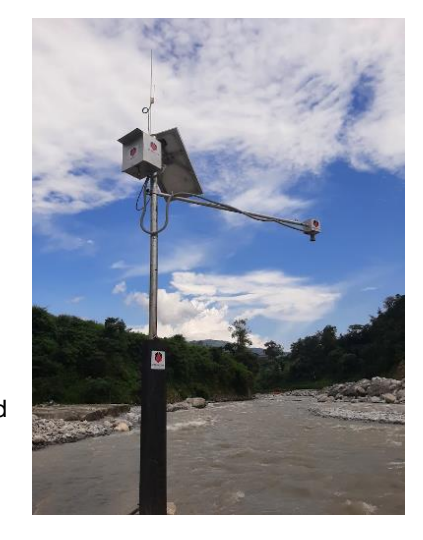
Photo of a Ground Sensor Terminal installed in Melamchi River for Flood Early Warning System

"We want people in Nepal to be able to pursue their dreams in without leaving the country."