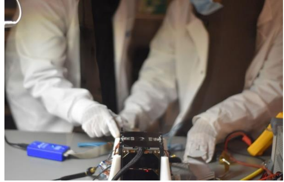
(Top) Aman team ©NSSA

(Below) The team working on their payload ©NSSA