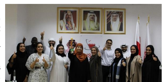
Team at NSSA with the IAF 3G Award

ccess to Space for All has supported our organization greatly, by providing a rare opportunity that would otherwise be inaccessible at this early stage of development of our agency. It will enhance our technical skills and expertise and build capacity in the Kingdom. We are also certain that this will boost confidence of our country in conducting space activities and attract more interest in STEM education and the space sector. Another great point is that this opportunity has enabled us to extend our relationship with various experts, regionally and internationally, which we hope will evolve to be a long-lasting and beneficial relationship.