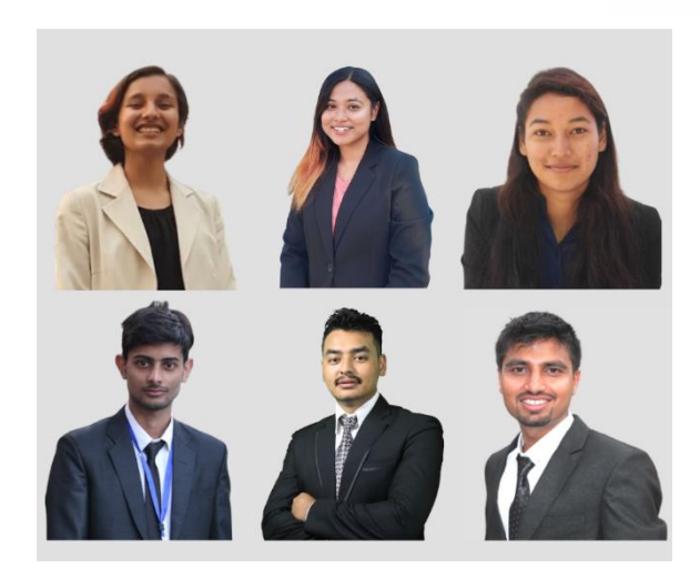
The members of the APN LoRa Payload mission

Through the APN LoRa Payload mission that we proposed for PHI, we will develop skills and obtain knowledge and expertise in space technologies. As explained earlier, developing human resources is a key objective and we believe that this boost in technological capabilities will not only benefit the space sector, but many other industrial sectors within the country. These aspects are linked to SDG #8 Decent Work and Economic Growth and #9 Industry, Innovation, and Infrastructure. I would also like to emphasize that half of the project members of the APN LoRa Payload mission are women, and we believe that we can be good examples and role models for women and girls who are interested in pursuing STEM education and careers. Furthermore, we anticipate more women and girls to be engaged in our project through the different outreach/educational activities we will conduct with the know-how that we will gain through PHI. Therefore, we see a strong connection with SDG #4 Quality Education and #5 Gender Equality.