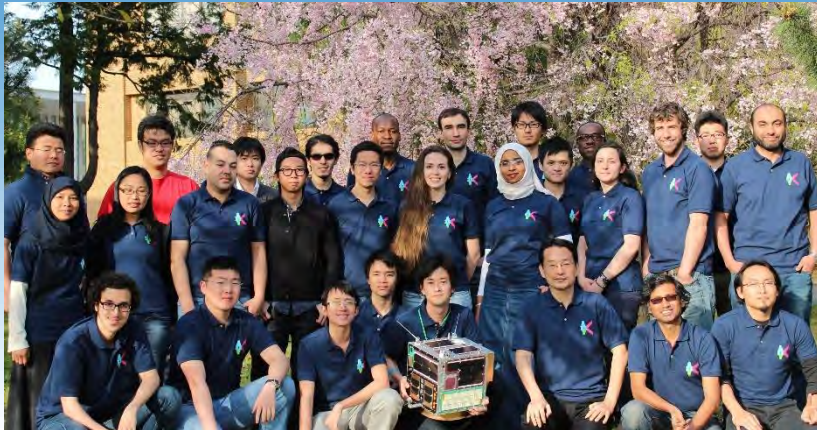
HORYU-IV team members