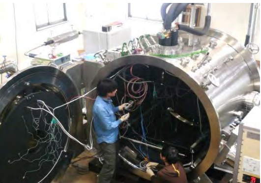
Thermal vacuum chamber at CeNT