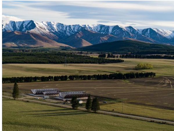
Figure 1: Kiwi Space Radar, Central Otago, New Zealand.

New Zealand collaborated with LeoLabs to create the Space Regulatory and Sustainability Platform with LeoLabs. A first of its kind among space agencies, this platform enables the New Zealand Space Agency to: