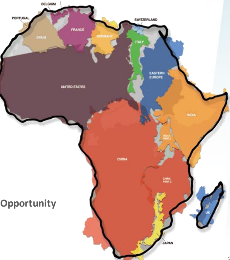
The African Opportunity

Agritech Prospecting Forestry Blue Economy Security Disaster Management