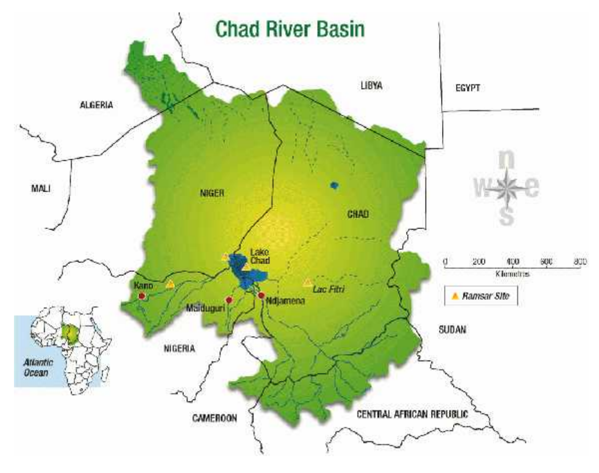
Figure 1: Image of Chad river basin showing Lake Chad

Mallam Yinusa; a northeastern Nigerian Fulani, semi-nomadic herdsman attended schools located along official grazing routes in the 1960s. However, due to changing climate patterns, the education of his grandson – Musa is at risk as his family is forced to move farther away from grazing routes in search of fodder for their dwindling cattle, a common scenario in the Lake Chad region.