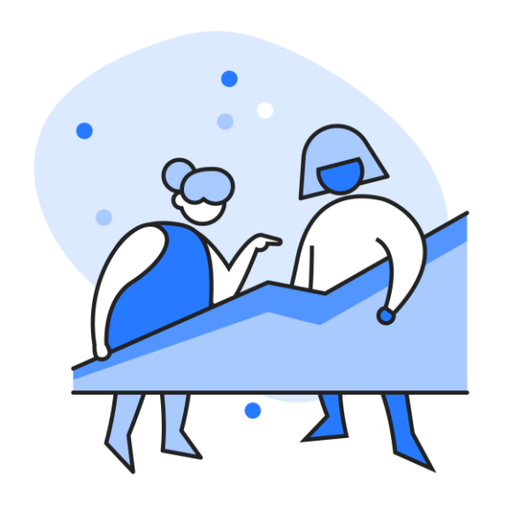
Build affordable and sustainable Finance models