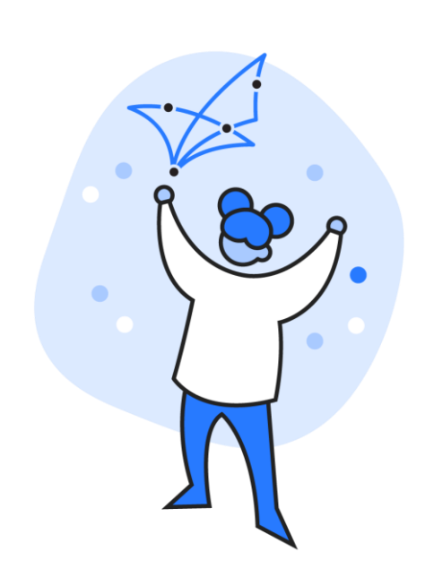
Empower learning and other skills and services via appropriate Digital Public Goods