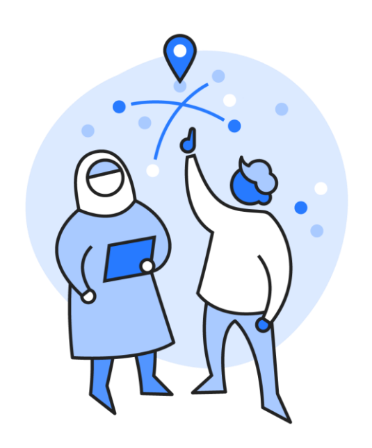
Map schools to identify connectivity gaps