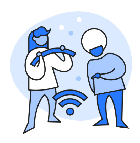
Implement fit-for-purpose infrastructure to Connect schools and ultimately every community and every citizen