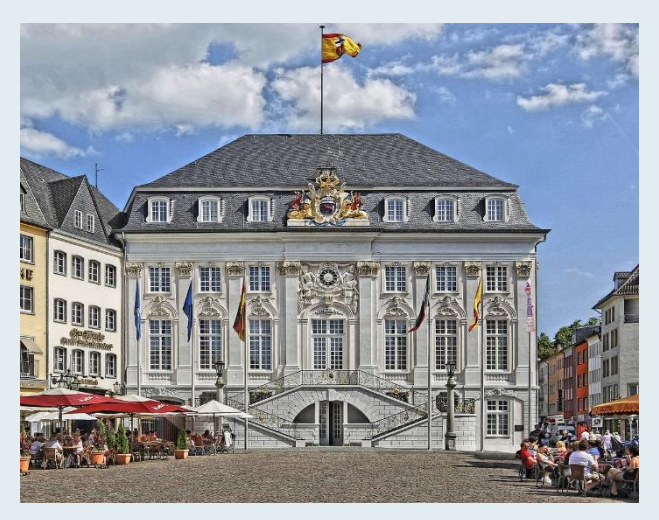
Altes Rathaus am Markt, Bonn

You can register for the Get Together Reception once you have received the official UNOOSA invent invitation, which will contain a dedicated form for the Side Events.