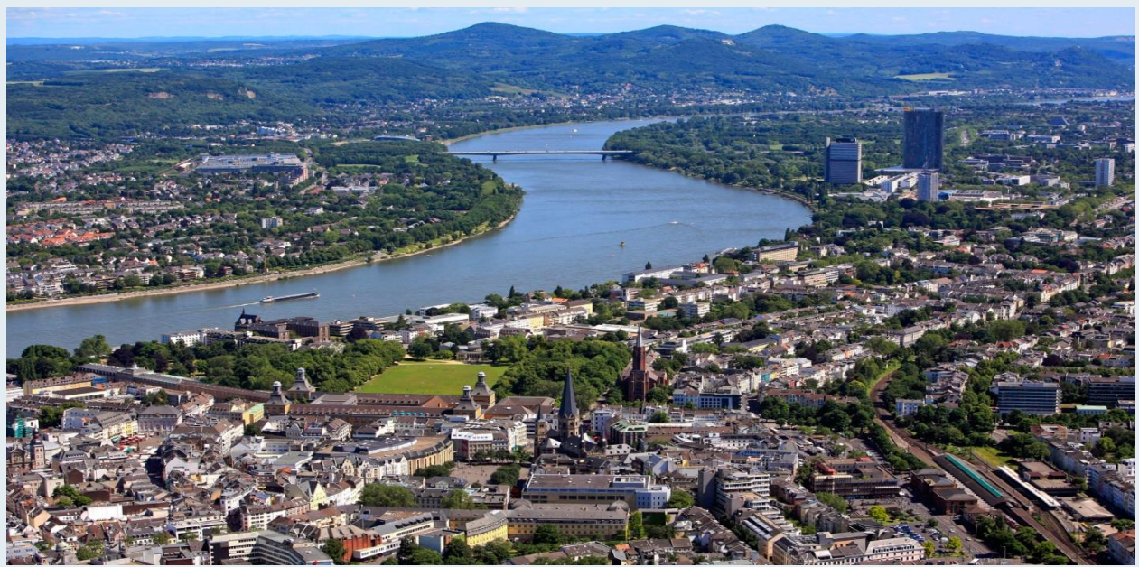
City of Bonn