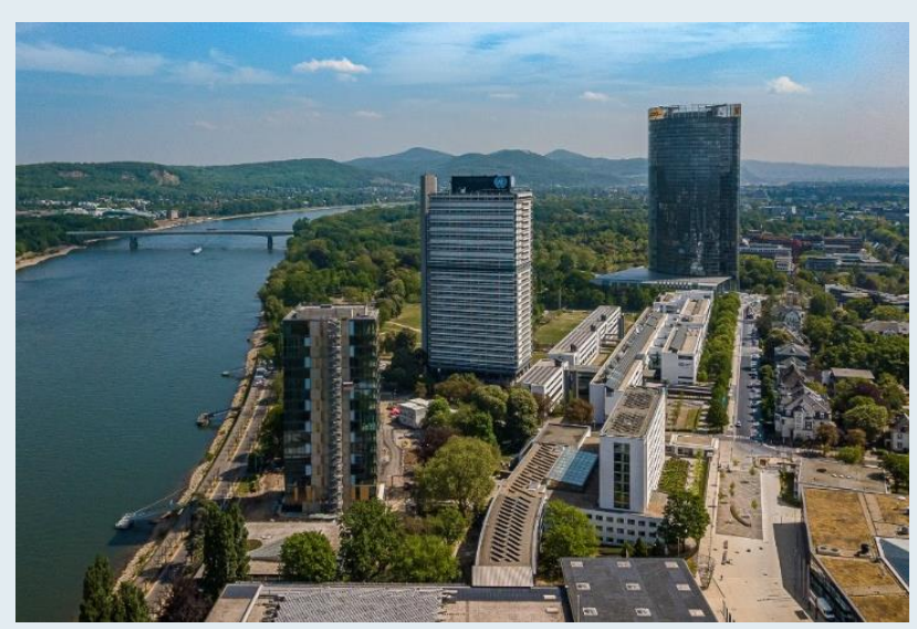
© Giacomo Zucca/Bonn UN_Campus_im_Fruehjahr_2020 UN Campus

Thanks to its research and development activities in the fields of aeronautics, space, energy, transport, digitalization, and security, DLR Space Administration, Germany's national space and aeronautics research center, makes important contributions to tackling societal challenges and helps to ensure sustainable development worldwide.