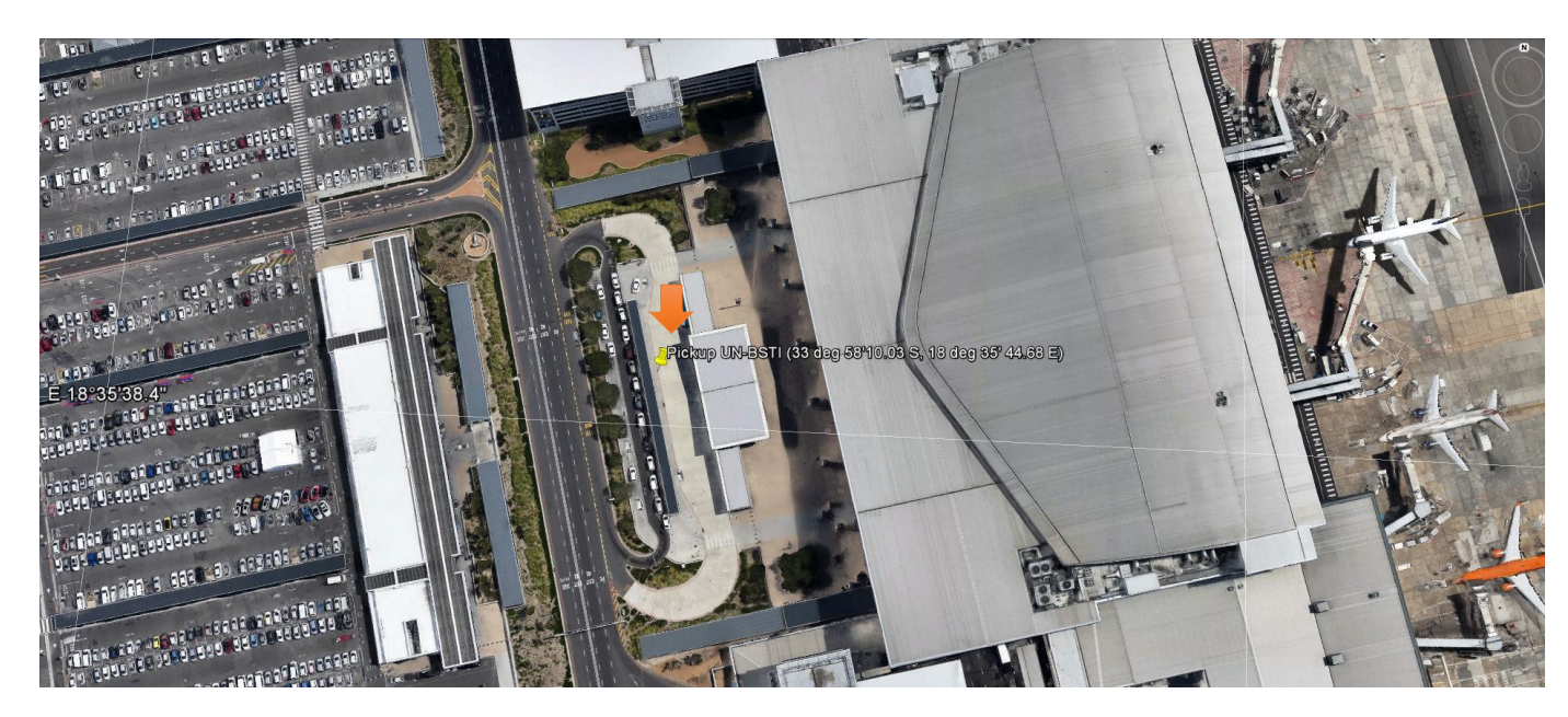
Public Transport Plaza pick-up point @ 33°58'10.03 S, 18°35'44.68 E

The Local Organizing Committee will organize shuttles between Cape Town airport and Stellenbosch on the following schedule;