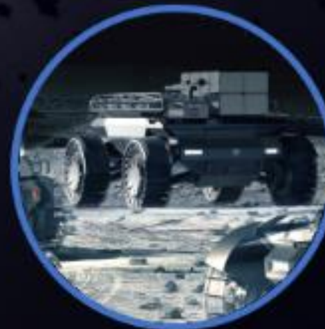
3. Space Science Missions