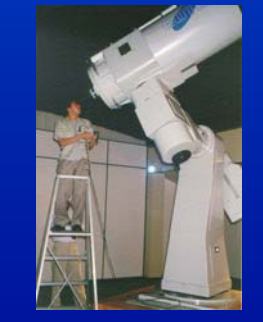
A.C. Clarke Institute for Modern Technologies (1996)