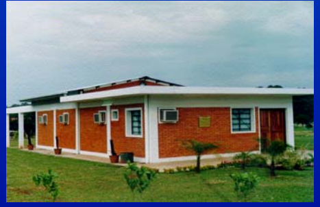
Universidad Nacional de Asuncion (2000)