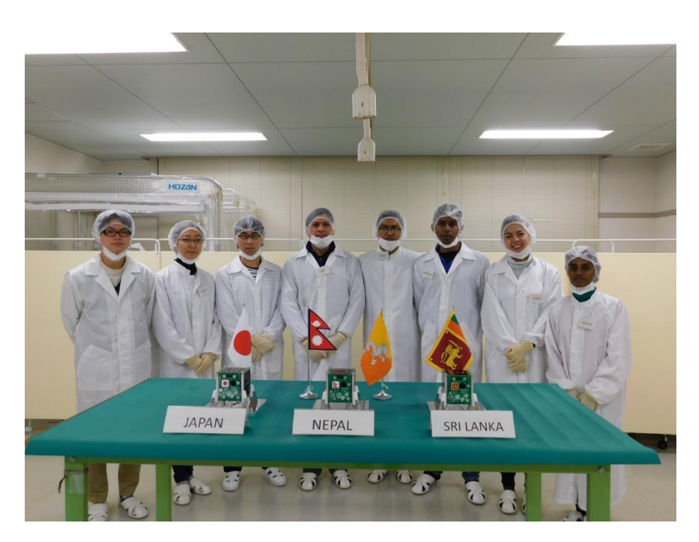
The BIRDS-3 team with the flight models

While taking the course, students are encouraged to get involved in hands-on satellite projects. I had joined the Bhutan satellite project too late to be part of the design stage, so, after this project was over, I sought out other projects where I could be involved in all phases of building a satellite. Next, I joined the BIRDS-3 project, that included the first satellites of Nepal and Sri Lanka. Here I was responsible for handling the power system, which is the very heart of a satellite and ensures uninterrupted power supply to the satellite from the beginning to the end of its life. My fellow participants in the project were from Sri Lanka, Nepal and Japan. The constellation of satellites was launched on April 17<sup>th</sup> 2019 and deployed from the ISS on June 17<sup>th</sup> 2019. The satellites have been operating flawlessly in space for more than a year now. Through the satellites, we have been taking pictures of different parts of the world and posting them on our official website (https://birds3.birds-project.com/). We also obtained significant amount of in-orbit data that will be used to model the space environment for future satellite projects.