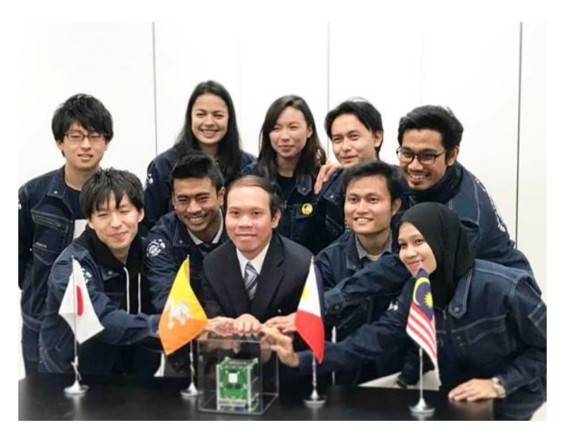
The BIRDS-2 team just before their satellites were delivered to JAXA

When I arrived at Kyutech in October 2017, the Bhutanese satellite was transitioning from engineering to flight model: when a satellite is in flight model, it means it is almost ready to be flown into space. I was so inspired by this project that I asked to join the team, becoming its fourth member from Bhutan. At the time they were doing the final testing and assembly and I was privileged to contribute to those tests and also to work on the ground sensors of the satellite, that enabled remote data collection after the launch. The satellite is a 1 unit cube satellite, with dimensions of 10x10x10 cm, and weighs just around 1kg.