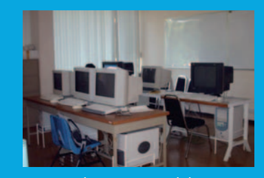
Postgraduate courses laboratory, Mexico