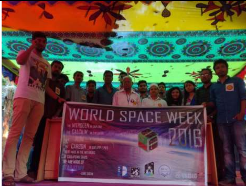
Picture 2: Bangladesh Astronomical Society invited UNISEC Bangladesh team at Enayetpur