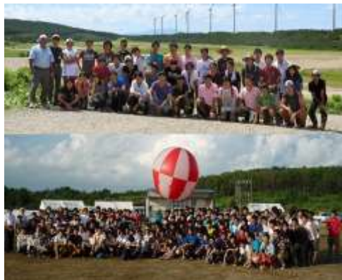
Participants for Satellite Launches