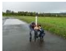
Preparation for Paper Rocket Launch