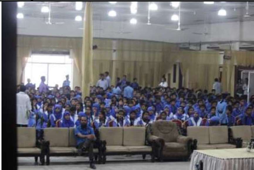
Picture 1 : Celebrated “World Space Week 2016” in BAF Shaheen School & College