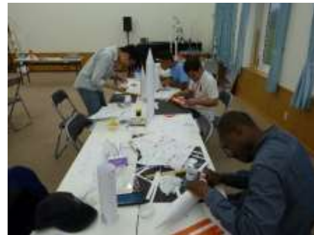
Paper Rocket Making