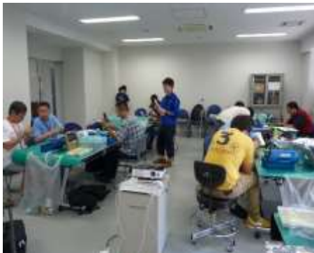
CanSat Hands-on Training