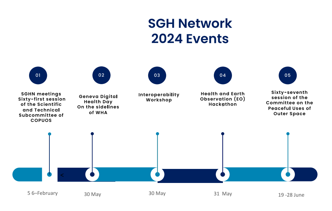
Figure – List of events planned until June. For information concerning events after June, please check the Geneva Digital Health Hub.

A/AC.105/1306 Paragraph 84: 'The identification of issues and concerns, as well as existing policies and regulations, could be taken as a first step towards establishing mechanisms to facilitate the development of spacebased technologies in support of global health. Participants recognized the need to advance further in terms of organizational and technical interoperability.